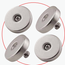
Optional Magnetic Holder Kit to Fix the Device